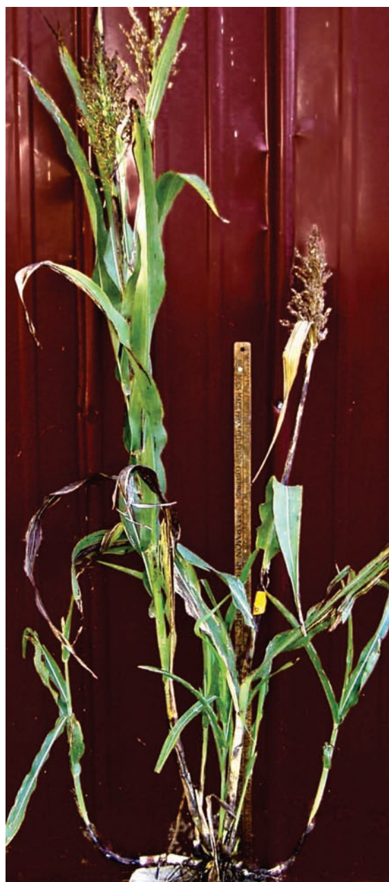
Figure 3. A relatively short sorghum plant with a relatively compact panicle (seed head) showing emergence of shoots from underground rhizomes in October 2005. This plant was excavated from a field experiment designed to evaluate families derived by self-pollination from hybrids between male-sterile grain sorghum and perennial sorghum. A meter stick is shown in the photograph. Fall emergence of rhizome shoots is not a desirable trait in itself, because such shoots will die with the first freeze. The ability to produce rhizomes is necessary for sorghum perenniality, however, and plants in which fall rhizome emergence is observed are more likely also to produce winter-hardy rhizomes that emerge the following spring. More than 300 plants in the population to which this plant belongs did emerge in spring 2006.

Even with expanded efforts, the road leading to perennial grains will be long, and it may often be rough; however, the time required should be put in context. Had large programs to breed perennial grains been initiated alongside the Green Revolution programs a half-century ago, farmers might well have had seed of perennial varieties in their hands today. As